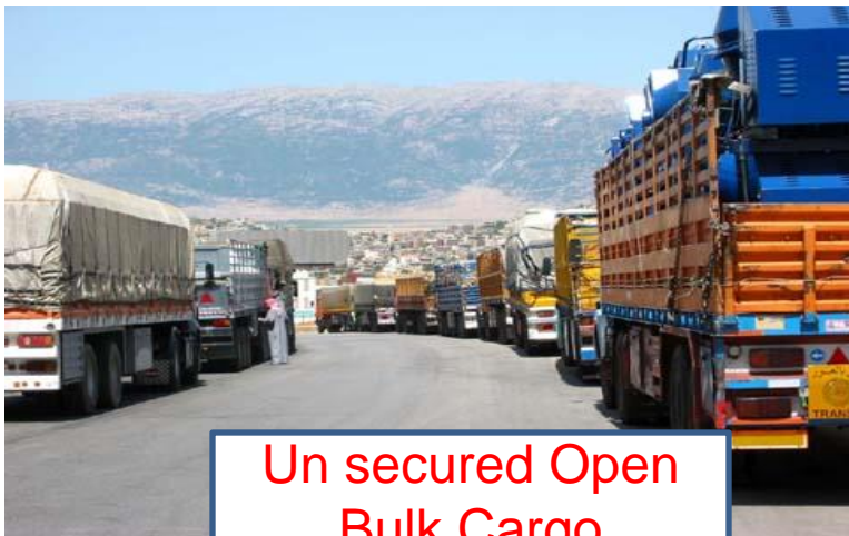
Un secured Open Bulk Cargo