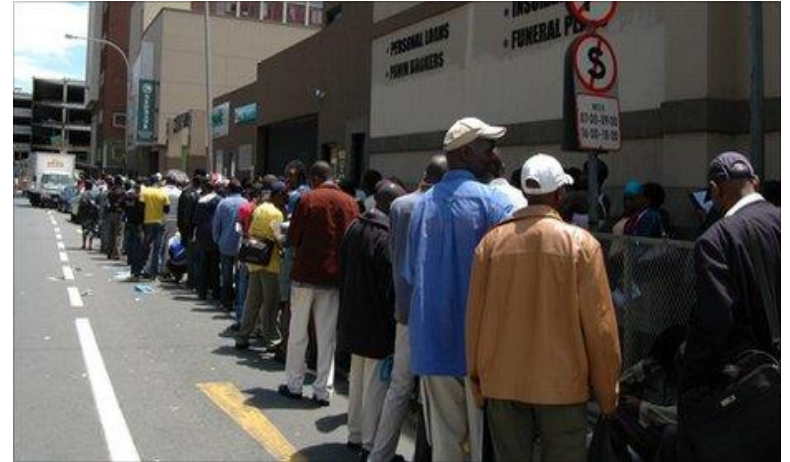
Delays in Clearance at Borders