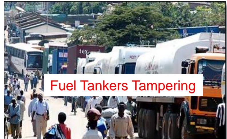
Fuel Tankers Tampering