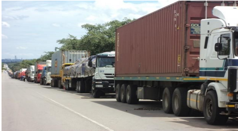
Long Queues at Borders